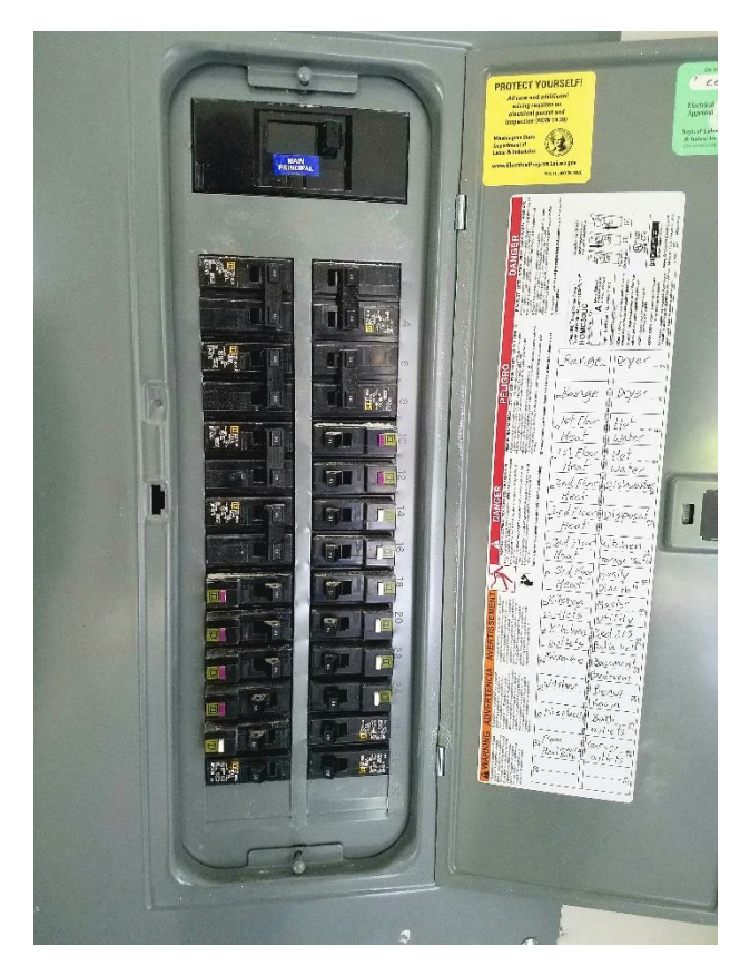
GROUND FAULT CIRCUIT INTERRUPTERS (GFCI)

Breakers usually trip because of overloads caused by plugging too many appliances into the circuit, a worn cord or defective appliance, or operating an appliance with too high a voltage or wattage requirement for the circuit. The sudden starting of an electric motor can also trip a breaker. If a breaker trips repeatedly check for any of the above causes.